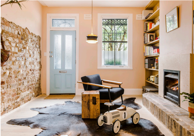
Sydney St, Erskineville

"I would recommend Advantage to any owner or Architect for a few reasons;